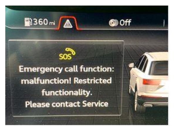
Figure 2. SOS warning in the instrument cluster.