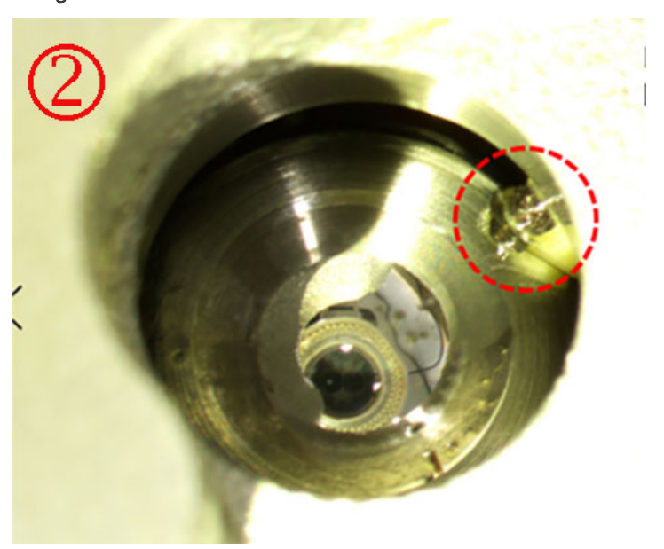
The foreign debris can be very small