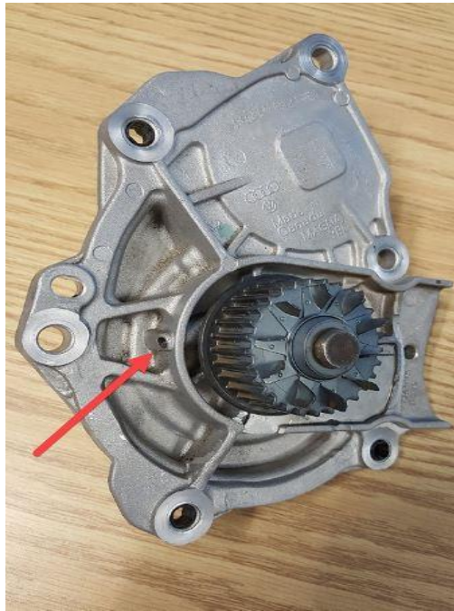
Figure 1. Control/weep hole leak.

The water pump should only be replaced if there is a leak from the control/weep hole (Figure 1). All other replacements are unauthorized i.e. combination replacement with the thermostat housing.