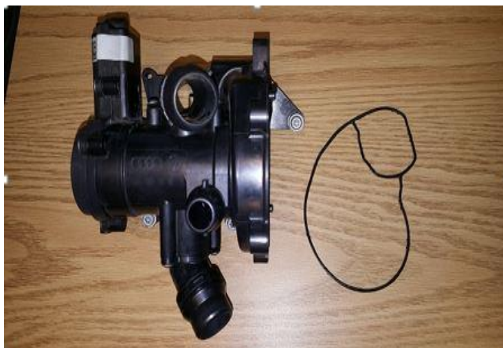
Figure 3. Thermostat housing replacement required parts.