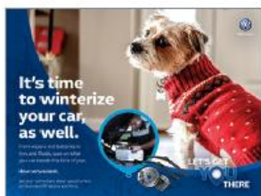
Service Poster In the main poster frame, switch out the Q3 poster with this new one for Q4.

Below are the materials included in your Base POP kit: