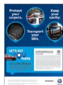
Counter Card with Rebate Pads Replace the Q3 counter card near the cashier with the one for Q4, so customers can grab a form at checkout. We've included an extra tear pad in the kit, but if you need more, they're available under item code VW19Q4R5PTRPD.