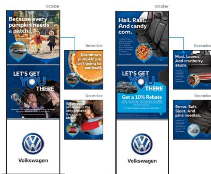
Service Graphic Display and Accessory Graphic Display This kit contains new Service and Accessory Graphic Displays for Q4 to replace Q3. Each month of the Q4 promotion (October-December), replace the top panel with the corresponding month's panel. The middle and bottom Q4 panels will remain the same throughout the promotion.