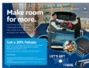
Accessories Poster In the secondary poster frame, switch out the Q3 poster with this new one for Q4.