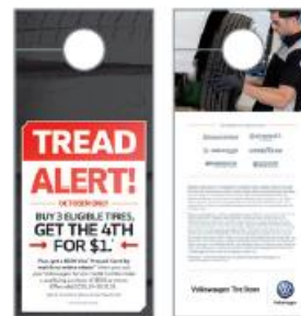
Hang Tags The enclosed hang tags are a great reminder of the ongoing "Buy 3" Tire Promo for your customers. Place them on the rearview mirror of customer vehicles before they leave your service lane.