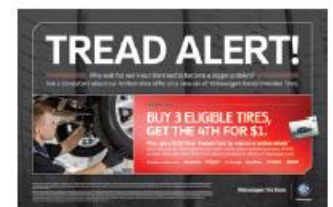
Window/Wall Clings Display this "Buy 3" cling near your Service Consultants' desks, in the service lane, or in your customer waiting area.