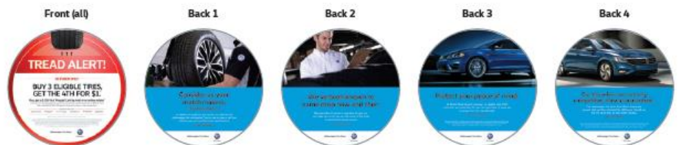
Tire Inserts Take the four tire inserts included in your kit and display them on tire stacks in your service write-up area. For an optimal fit, display the inserts using eligible 17" or 18" tires. The backs of the inserts include tire-value messages you can keep up all year long, even after the promotion ends.

For the Promotion Guide: Click Here For the List of Eligible Tires: Click Here