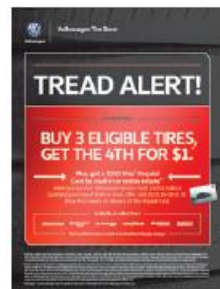
Counter Mat Insert Place the counter mat insert inside the counter mat and display it on the cashier's counter or in your service write-up area.

In addition to printed POP materials, all assets are available for display on your digital dashboard. Please visit the VW Digital Asset Management (DAM) platform located on the VWHub to download the available digital POP assets.