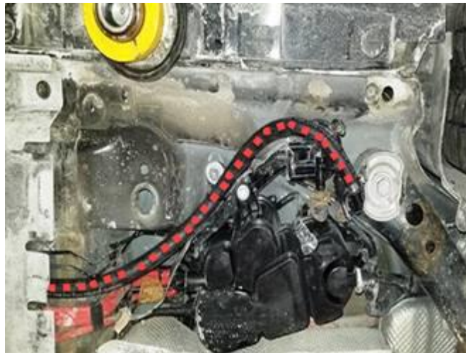
Figure 8. Connecting to the J909.