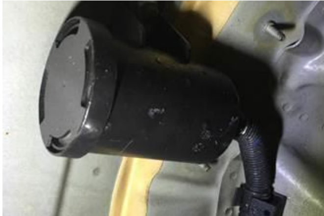
Figure 2. Ventilation tube of the EVAP canister.