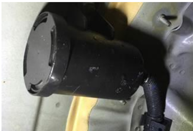
Figure 10. Remove original NVLD filter.