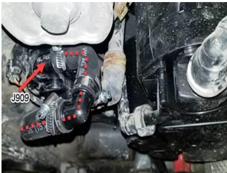
Figure 9. Closer look at the connections.