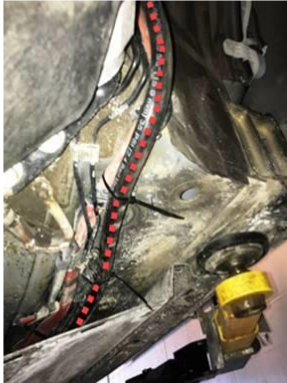
Figure 7. Where to zip tie the rubber hose to the battery cable.