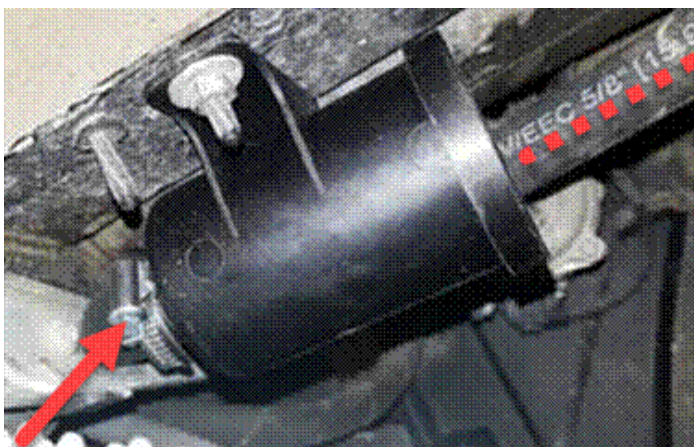
Figure 4. Connecting the NLVD filter.

Route the 5/8" ID rubber hose behind the strut and brake lines from new filter position to the J909, along the orange battery cable (Figure 5 and 6). Then secure with zip ties.