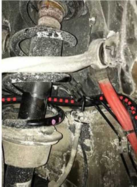
Figure 6. Routing the rubber hose.