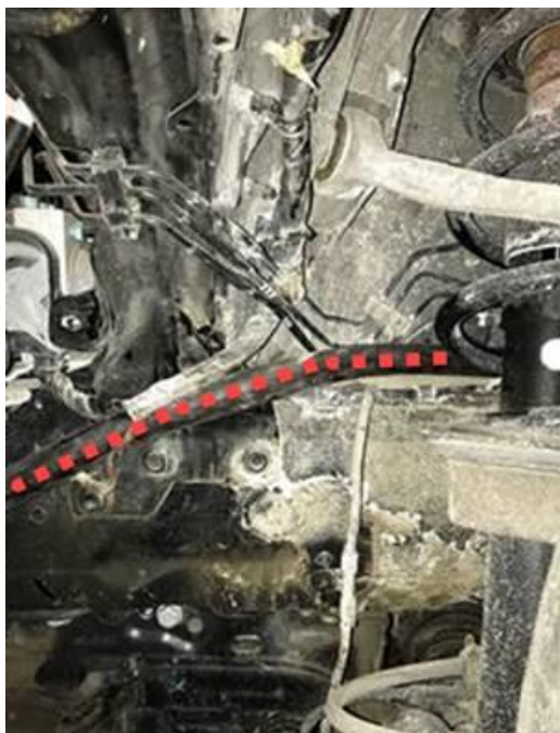
Figure 5. Route the 5/8" ID rubber hose from new filter position to the J909.

5/8" ID rubber hose needs to be routed in a way that there are no sharp bends to prevent kinking.