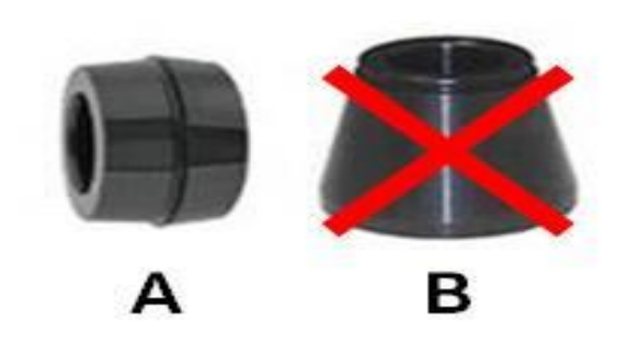
Figure 2. Example of a collet (A) vs. a centering cone (B).