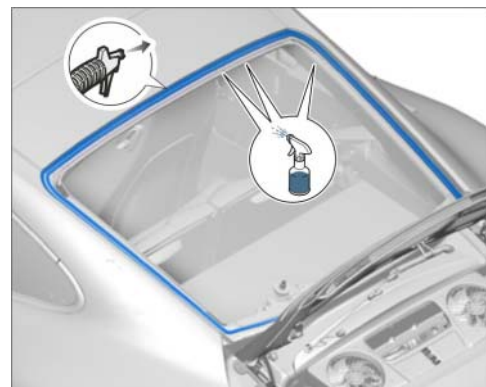
Checking rear window

If the bonding is detached , the rear window must be replaced (see Step 2).