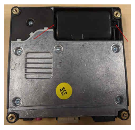
Figure 1. Backup battery compartment location.