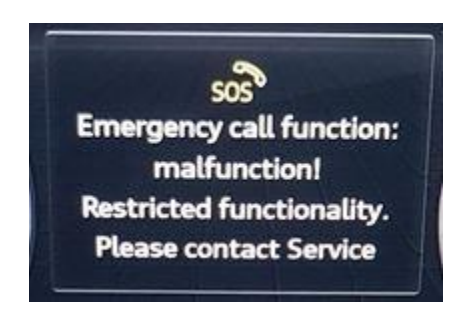
Figure 1. Emergency call malfunction warning.

• An SOS Warning is displayed in the instrument cluster (Figure 1).