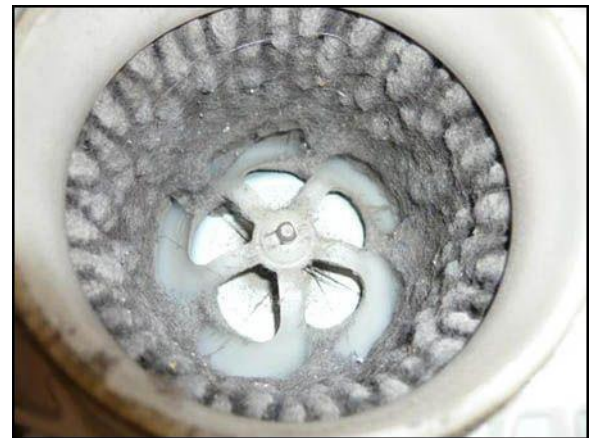
Figure 1. Clogged Cooling Fan

Refer to TIS, applicable model year Repair Manual: