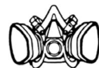
Example of a NIOSH-approved respirator