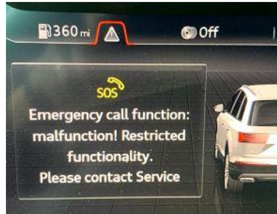
Figure 2. SOS warning in the instrument cluster.