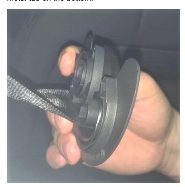
Figure 6. Seat belt deflector with new guide installed.

7. Push the new guide into the bolt hole until you can hear the plastic retainers snap into place (Figure 6).