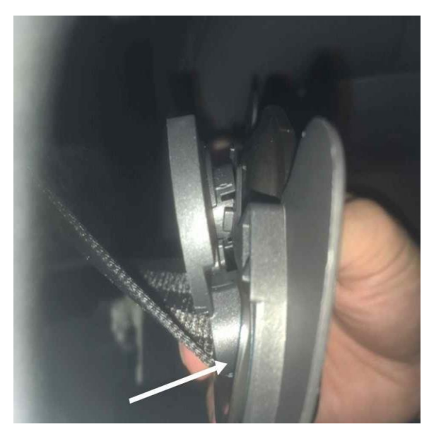
Figure 5. Installing modified seat belt guide starting with the metal tab on the bottom.

6. Start installing the modified seat belt guide at the deflector metal tab (Figure 5).