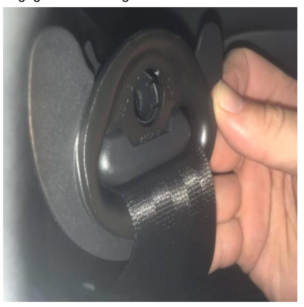
Figure 3. Removing old seat belt guide starting at the bolt hole.

4. With the old belt guide removed, turn the seat belt webbing to remove the twist (Figure 4).