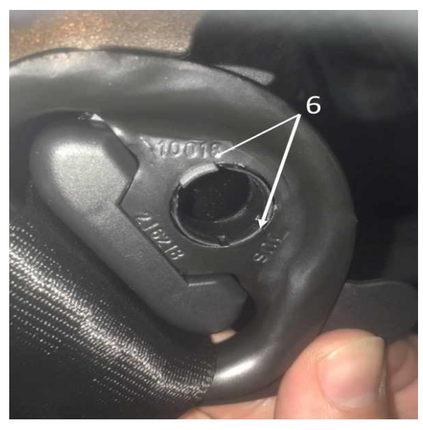
Figure 7. Belt guide locking tabs correctly secured at bolt hole.

8. Inspect the front of the deflector for proper installation of the guide locking tabs at the bolt hole (Figure 7, Pos. 6)