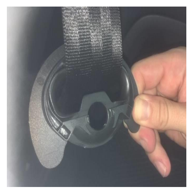
Figure 4. Old seat belt guide removed. Seat belt twist corrected.

4. With the old belt guide removed, turn the seat belt webbing to remove the twist (Figure 4).