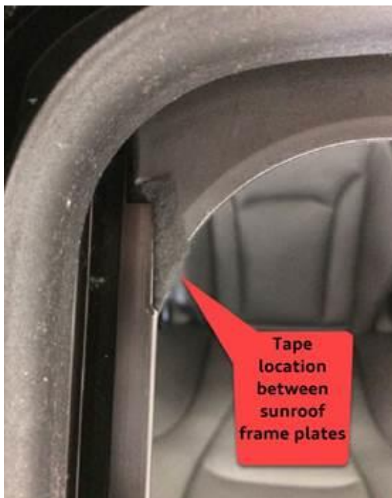
Figure 6. Webbing adhesive tape applied between the side and front sunroof frame plates.