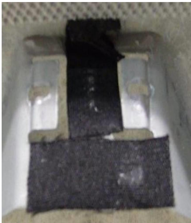
Figure 2. Location of the webbing adhesive tape application.