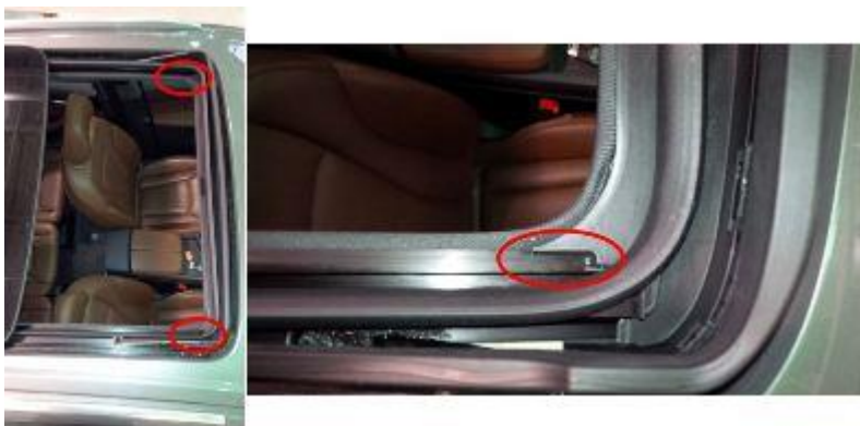
Figure 5. Areas of the sunroof frame to be isolated with webbing adhesive tape.