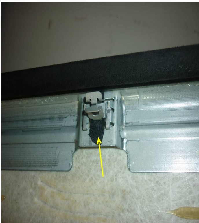
Figure 3. Clips reinstalled.