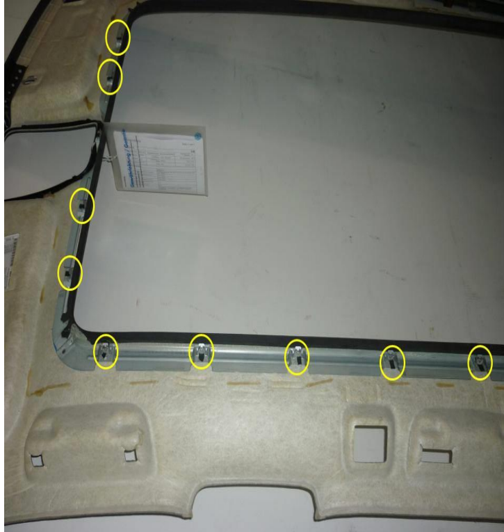
Figure 1. Location of the headliner to sunroof frame clips.