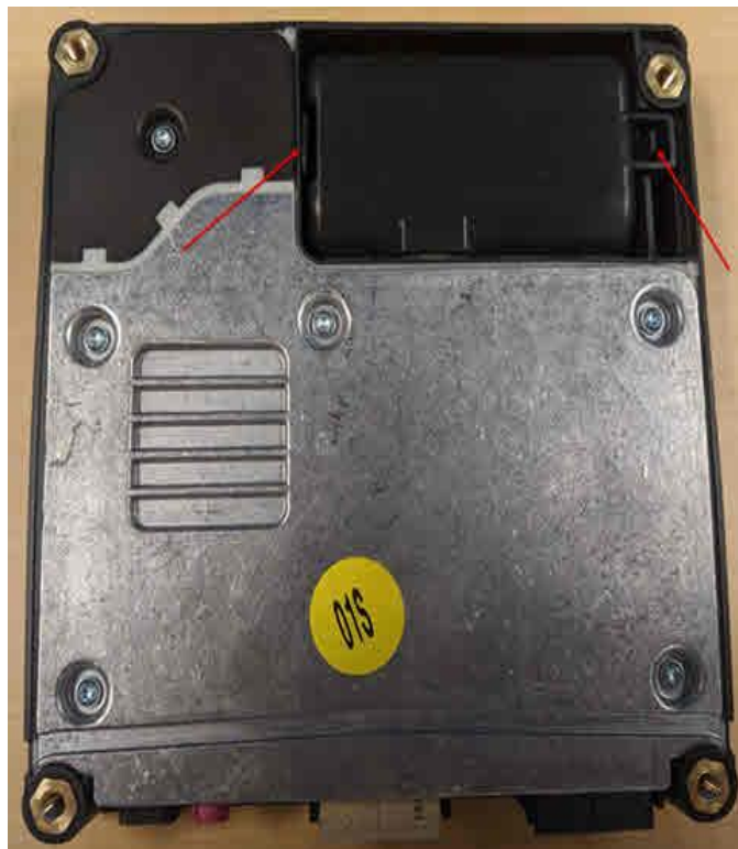
Figure 1. Backup battery compartment location.