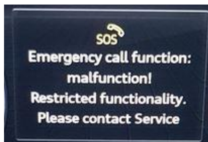
Figure 1. Emergency call malfunction warning.