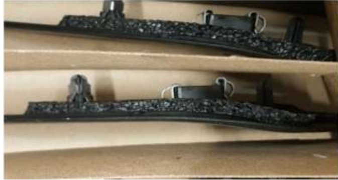
Fig 3 Mirror Flag. Top Ok. Bottom clip not seated.

This document does not authorize warranty repairs. This communication documents a record of past experiences. STAR Online does not provide any conclusions about what is wrong with the vehicle. Rather, it captures all previous cases known that appear to be similar or related to the vehicle symptom / condition. You are the expert, and you are responsible for deciding on the appropriate course of action.