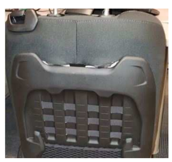
Fig. 1 Gap Between Seat Back and Panel