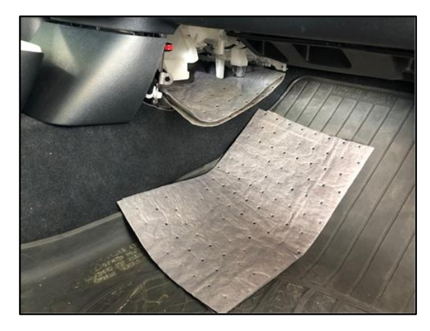
Figure 2. Recommend Industrial Absorbent Pads

2. Cover the area under the HVAC unit and its surroundings.