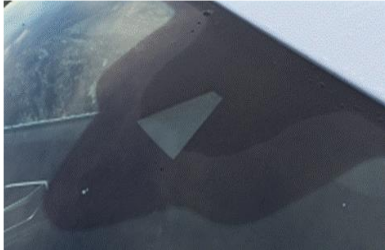
Figure 1. Viewing area fogged up from outside.

The viewing area of the front camera can be fogged up both on the inside and/or on the outside (Figure 1 and 2).