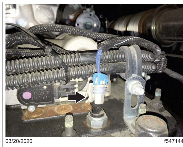
Fig. 1, Connector Unplugged