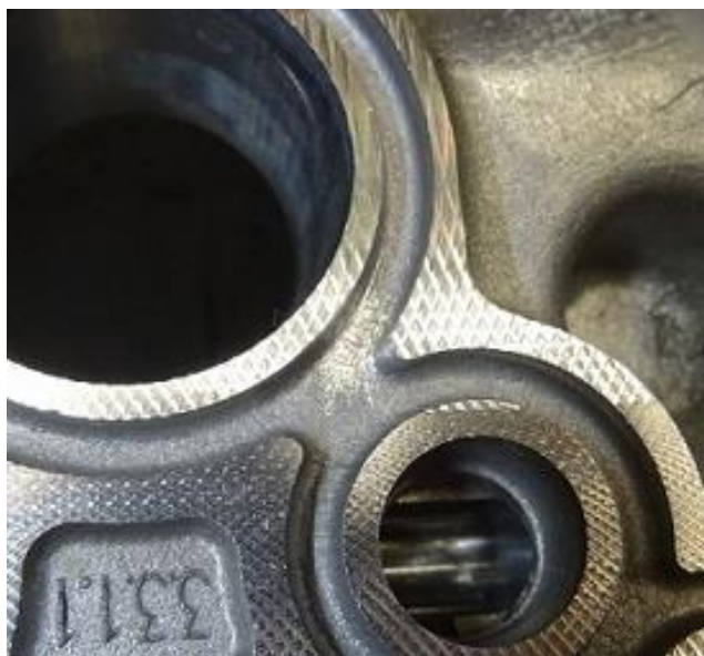
Figure 6. After the repair.

For vehicles with a production date starting 10/01/2018, please take a picture of the metal casting debris before filing, and upload to DOC-IT with the corresponding VIN of the vehicle.