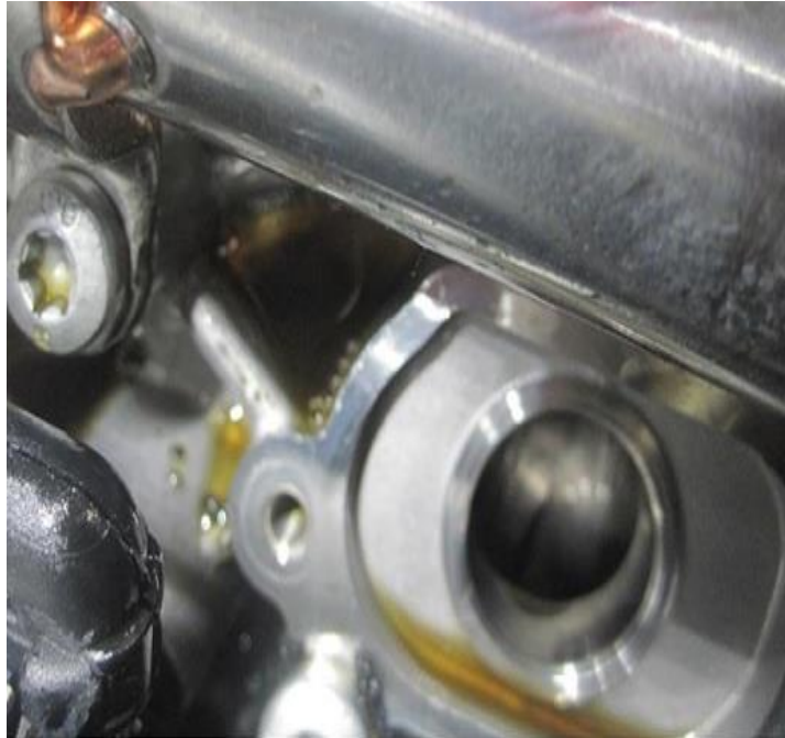
Figure 2. Oil in the Audi valvelift system.

B. If there is no substantial quantity of oil below the Audi valvelift system actuator continue with Step 4!