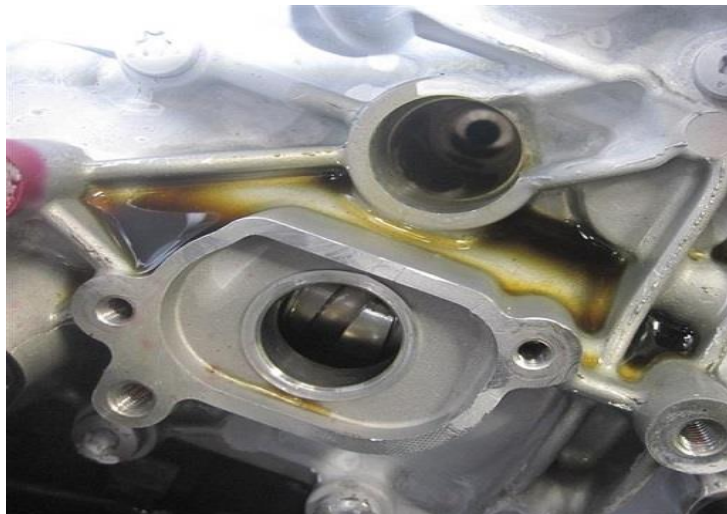
Figure 3. Locating the affected cylinder.

5. Locate the affected cylinder. Here oil should have gathered in the area of the injector (Figure 3) and the noise insulation should also be full of oil.