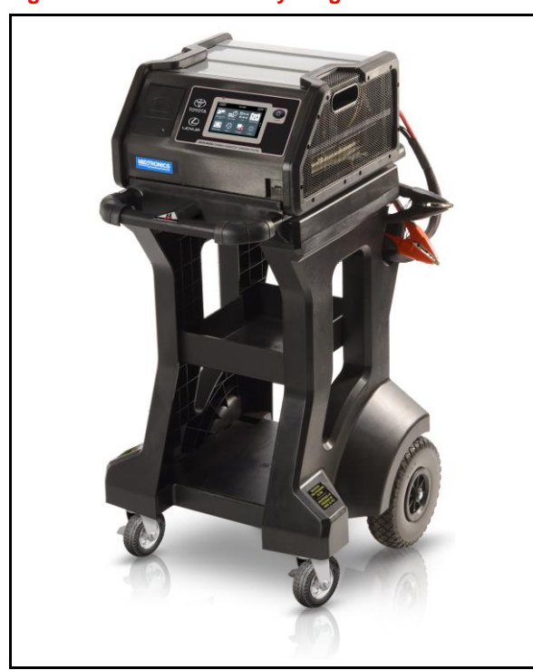
Figure 1. DCA-8000 Battery Diagnostic Tool