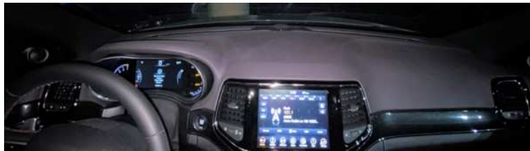
Fig. 2 Entire Width Of IP Cover For Claim Submittal

NOTE: A new steering wheel bolt must be used for the Repair Procedure.