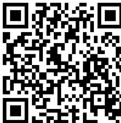
Figure 4. QR code for viewing the video with a QR code reader on phones and tablets. Alternatively, the video can be accessed through computer internet browsers at the link provided in this bulletin.

See TSB 2039206: 00 Viewing TSB videos for more information about viewing videos.