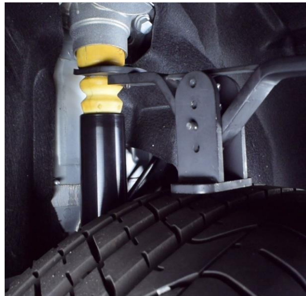
Figure 2. The SET900 tool being used to install a rear bump stop.