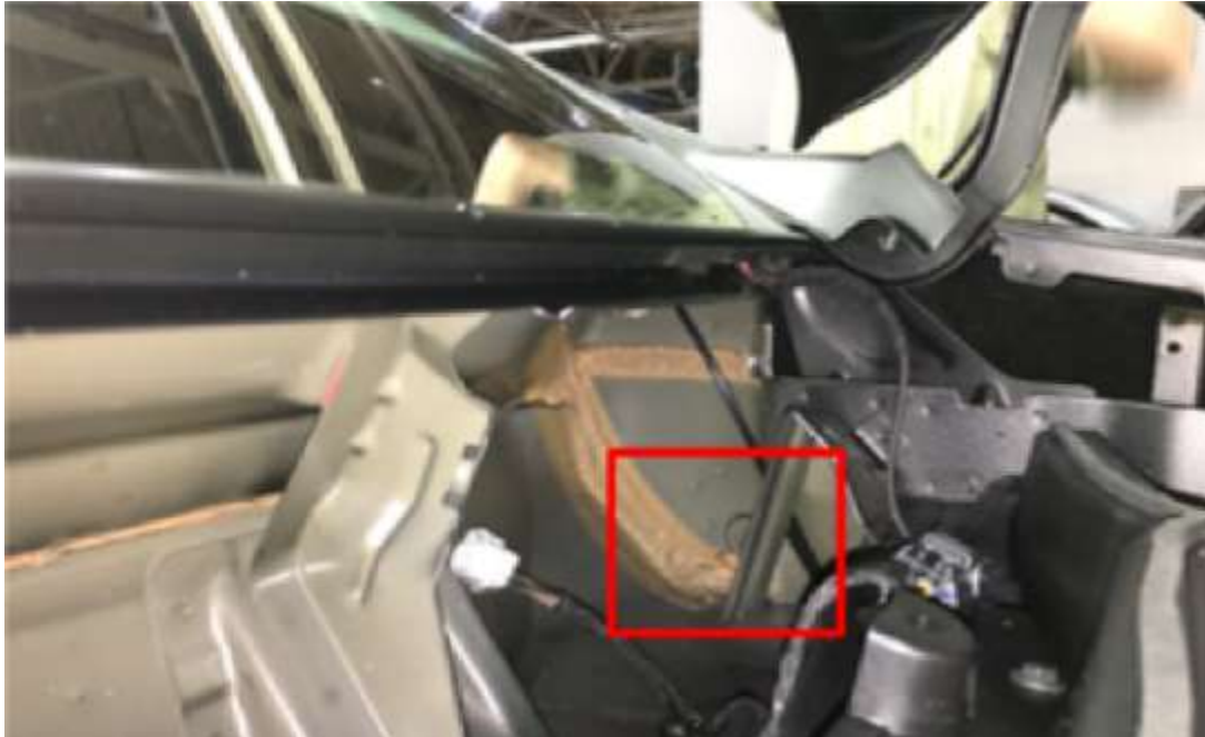
Drivers side load beam (engine side)

Another area to inspect is the load beam to cowl inner joint. Look for sealer skips, holes ect.. This area can be repaired in service using the Kent P10200 High Tech Clear Seam sealer. Figures below show drivers side, but passenger is similar.