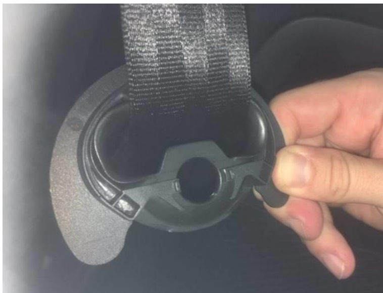
Figure 4. Old seat belt guide removed. Seat belt twist corrected.