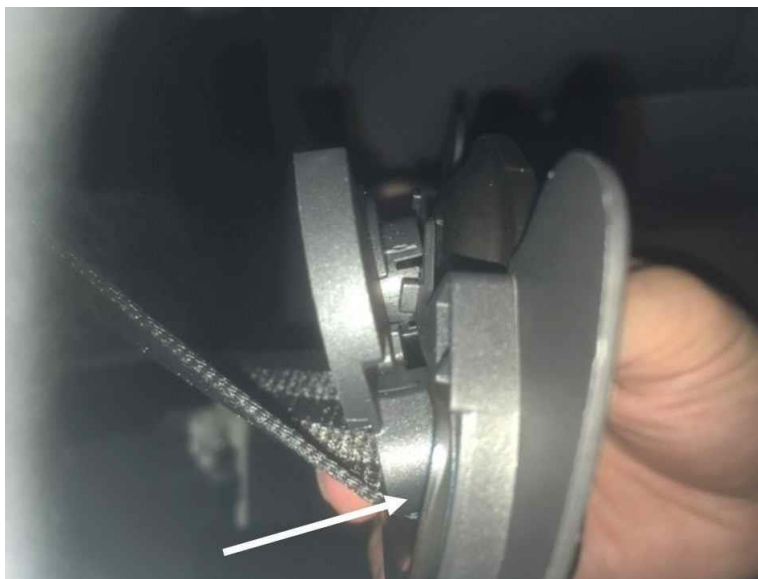
Figure 5. Installing modified seat belt guide starting with the metal tab on the bottom.