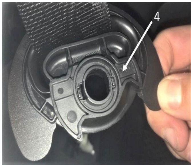
Figure 2. Backside of seat belt deflector. Deflector trim tabs engaged in old belt guide.

Do not use sharp objects to remove the old belt guide to avoid damaging the seat belt webbing.