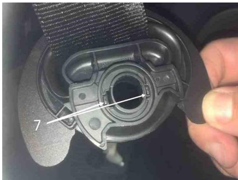
Figure 8. Seat belt deflector trim locking tabs properly secured to seat belt guide.