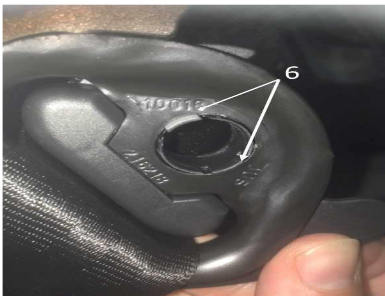
Figure 7. Belt guide locking tabs correctly secured at bolt hole.