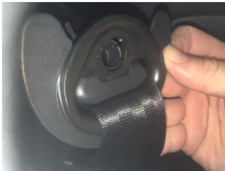
Figure 3. Removing old seat belt guide starting at the bolt hole.