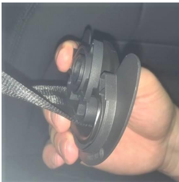
Figure 6. Seat belt deflector with new guide installed.