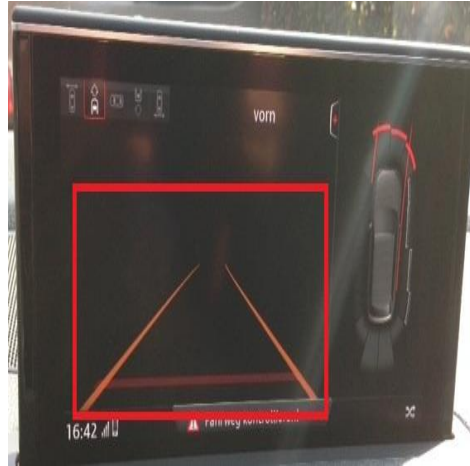
Figure 1. Only static lines are displayed.