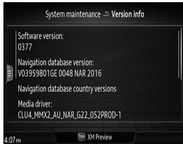
Figure 2. MIB2