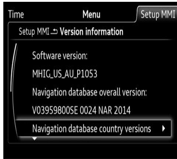
Figure 1. MIB1 & MIB2 for C7 PI.

The “overall version” indicates the oldest version installed for any single region. With MIB systems, the MMI can have partial updates installed with only certain updated regions. In such a scenario, the overall version will only be changed when all regions of the map database are updated to the same level. Select “Navigation database country versions” to see the updated level of each region installed.