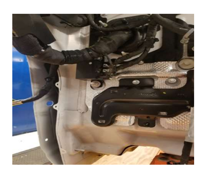
Fig 1, PCR relay location below PDC

This document does not authorize warranty repairs. This communication documents a record of past experiences. STAR Online does not provide any conclusions about what is wrong with the vehicle. Rather, it captures all previous cases known that appear to be similar or related to the vehicle symptom / condition. You are the expert, and you are responsible for deciding on the appropriate course of action.