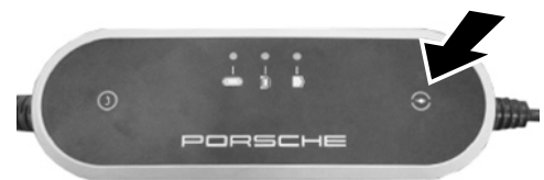
Porsche mobile charger