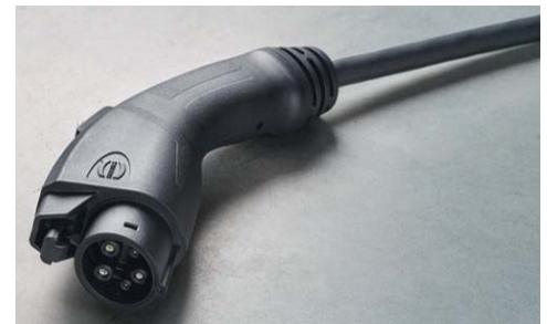
Vehicle cable, type 1