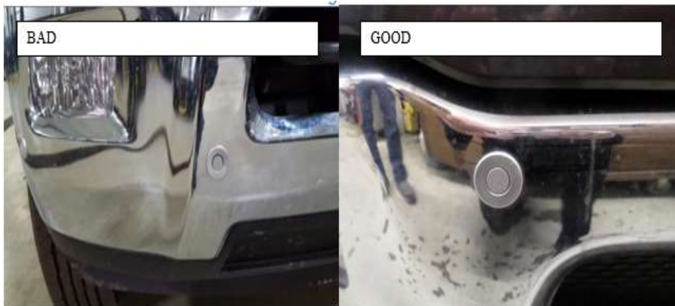
Example/ DS truck park sensor mounting