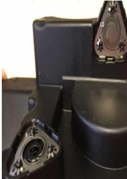
Figure 1. Metal plates.

If one plate is defective then always replace both (included in the pressure regulating valve repair kit).