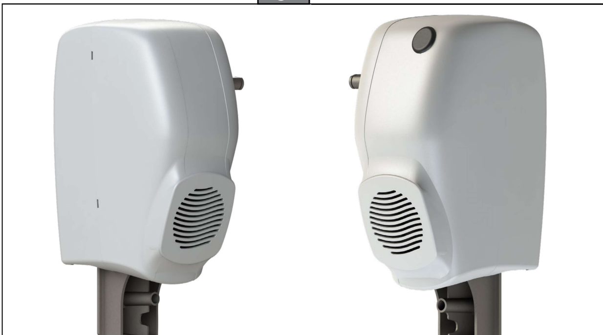
Regal Idler head with speaker