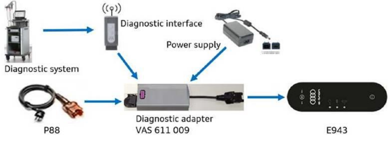
Figure 1. VAS 611 009.