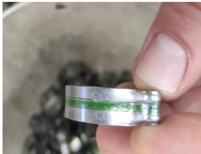
Figure 10: collar markings

After the replacement of the damaged hose(s) and the securing clamp(s) on the cabin heater side, perform a road test to verify the performance of the engine cooling system.