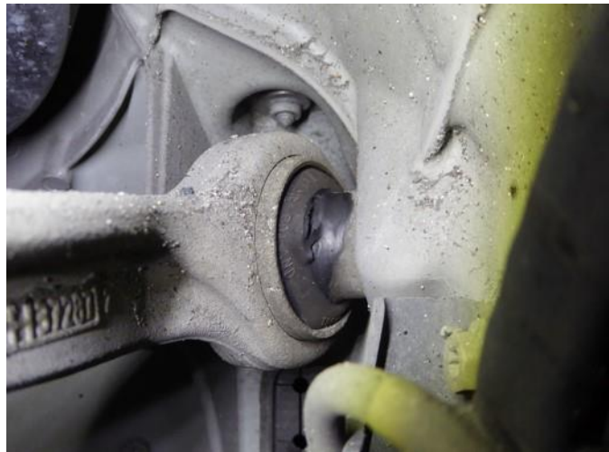
Figure 1. Damage to the rubber mounting.