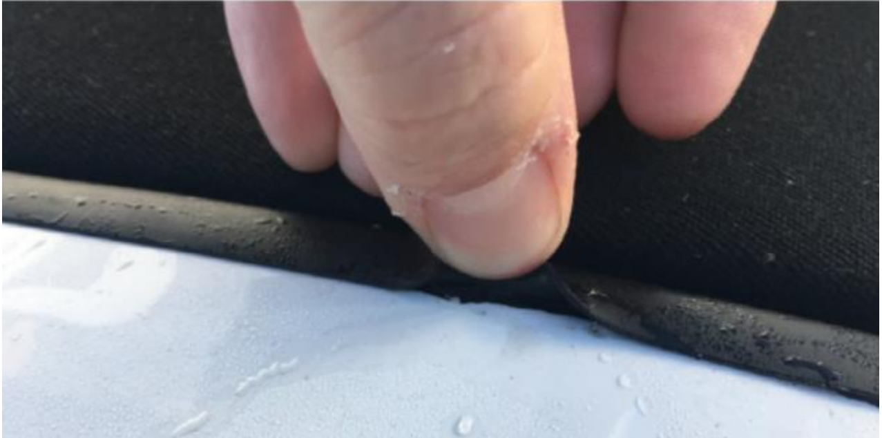
Fig 3 inspect for butyl void(s).