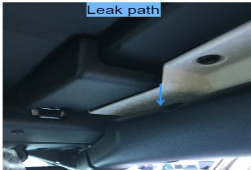
Fig 1 water leak path

Discussion: A leak coming from the far corners (front or rear) of a Sky Slider could be the result of water leaking under the side seals. The side seals are sealed to the body with butyl. If the butyl is not “bedded” or sticking to both the seal and the body or if there is a skip/void in the butyl water could go under the seal and come in to the Jeep.