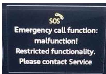
Figure 1. Emergency call malfunction warning.