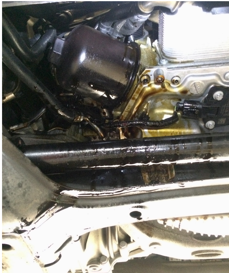
Active leak #1 overview of oil on engine