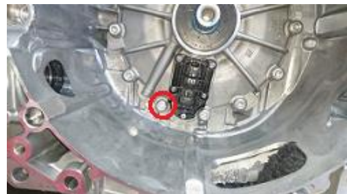
Figure 1. Bolt location.