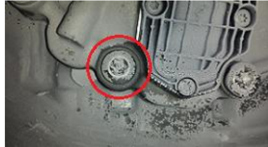
Figure 2. Leak location.