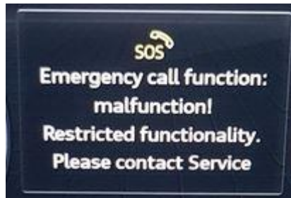
Figure 1. Emergency call malfunction warning.