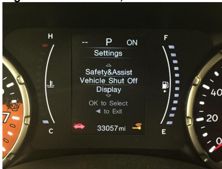
Step 2: Navigate and select “Safety&Assist Vehicle Shut Off”

This document does not authorize warranty repairs. This communication documents a record of past experiences. STAR Online does not provide any conclusions about what is wrong with the vehicle. Rather, it captures all previous cases known that appear to be similar or related to the vehicle symptom / condition. You are the expert, and you are responsible for deciding on the appropriate course of action.