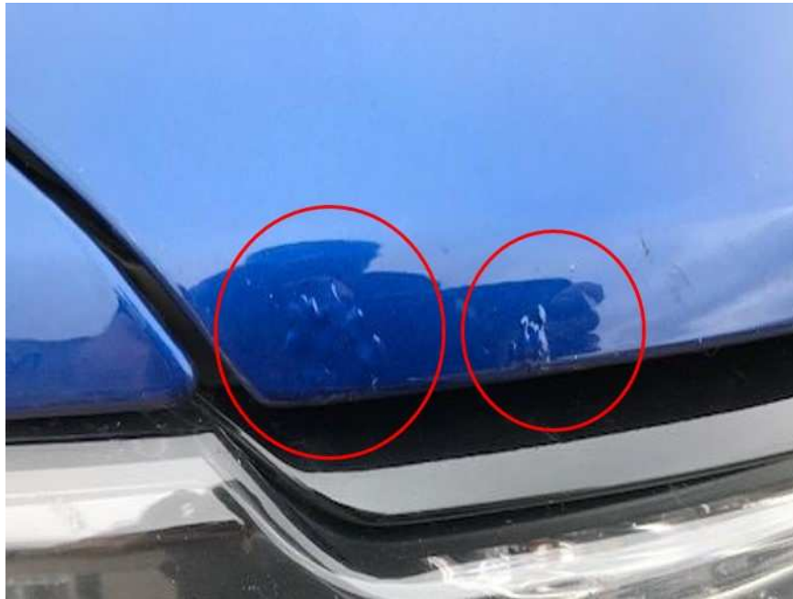
Fig. 2 Examples of Corrosion Along Leading Edges

Is corrosion evident on the aluminum panel surface (Fig. 2) ?