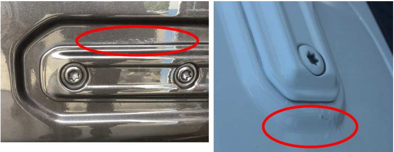
Fig. 1 Examples of Bubbling

Aluminum corrosion or bubbling on the doors and/or hinges (Fig. 1) .