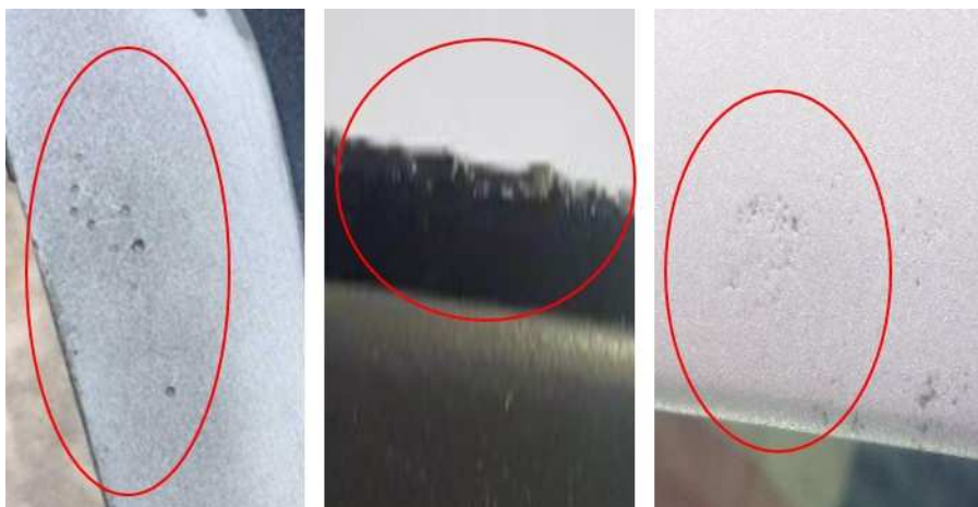
Fig. 3 Corrosion Examples