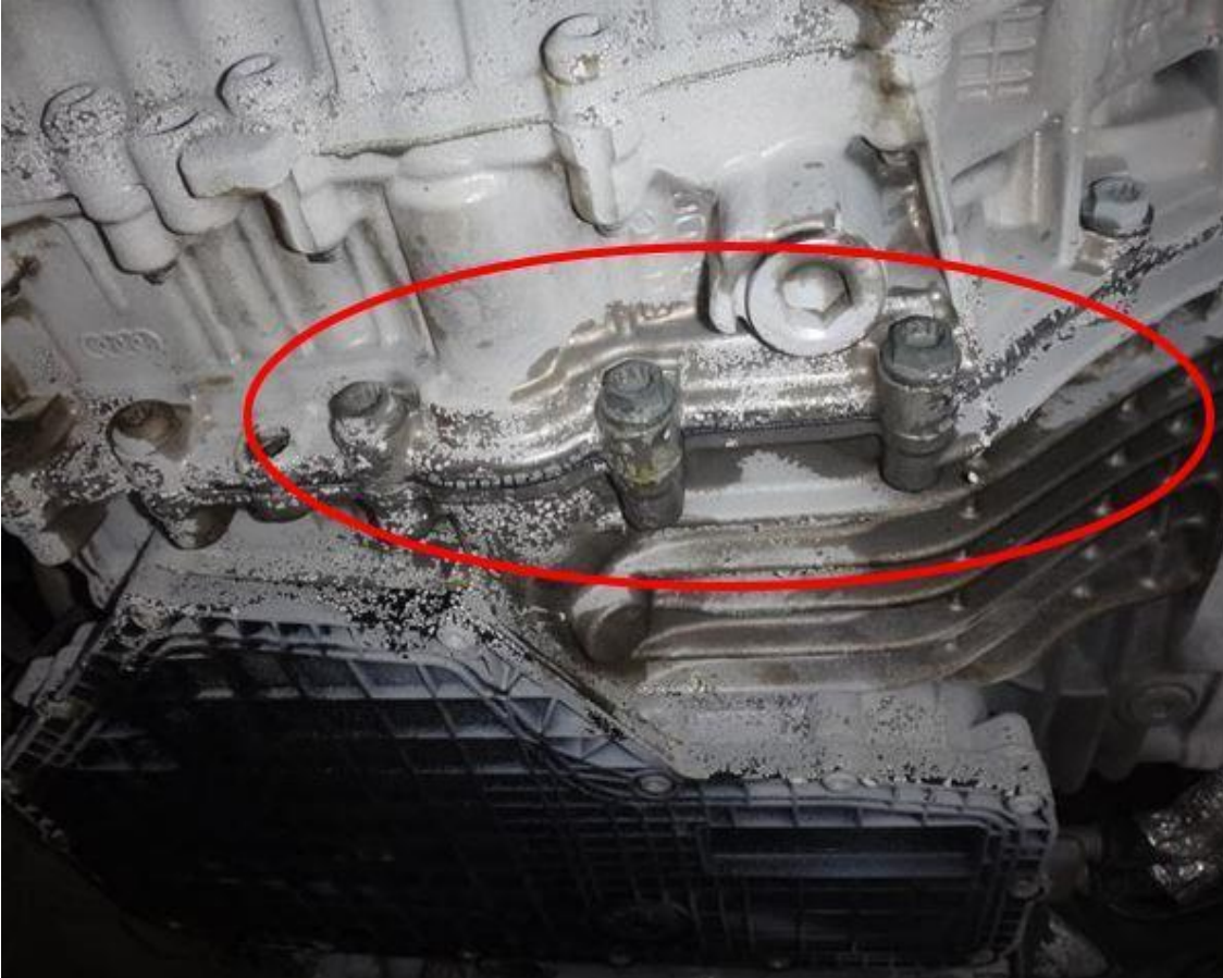
Figure 2. Oil leak example.