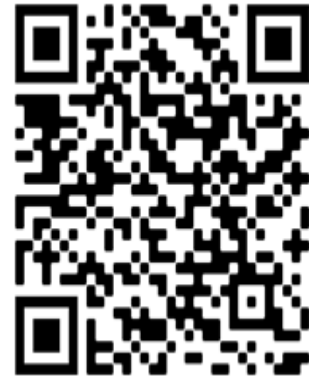
Figure 1. The QR code for the supporting video.

The video is also attached to this TSB under the attachments tab in the workshop manual.