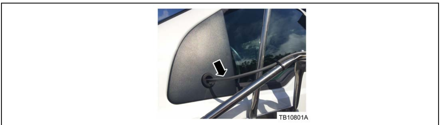
Figure 2 - Article 16-0061

NOTE: The information contained in Technical Service Bulletins is intended for use by trained, professional technicians with the knowledge, tools, and equipment to do the job properly and safely. It informs these technicians of conditions that may occur on some vehicles, or provides information that could assist in proper vehicle service. The procedures should not be performed by "do-it-yourselfers". Do not assume that a condition described affects your car or truck. Contact a Ford, Lincoln, or Mercury dealership to determine whether the bulletin applies to your vehicle. Warranty Policy and Extended Service Plan documentation determine Warranty and/or Extended Service Plan coverage unless stated otherwise in the TSB article. The information in this Technical Service Bulletin (TSB) was current at the time of printing. Ford Motor Company reserves the right to supersede this information with updates. The most recent information is available through Ford Motor Company's on-line technical resources.