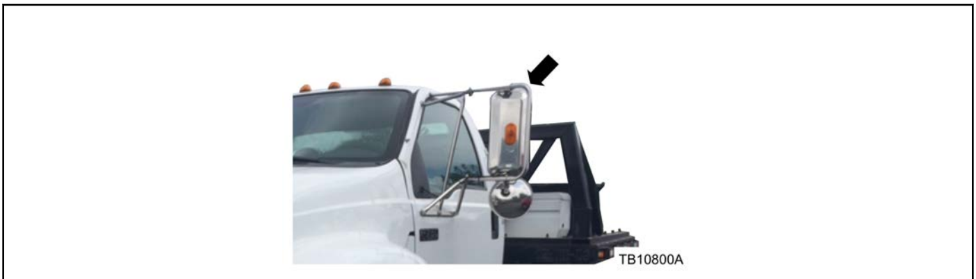
Figure 1 - Article 16-0061