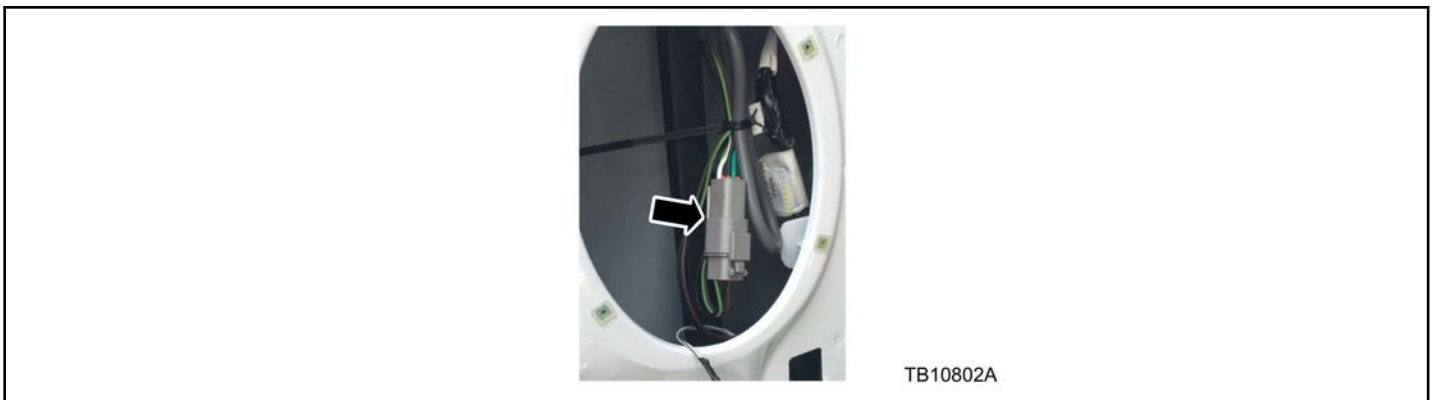
Figure 3 - Article 16-0061