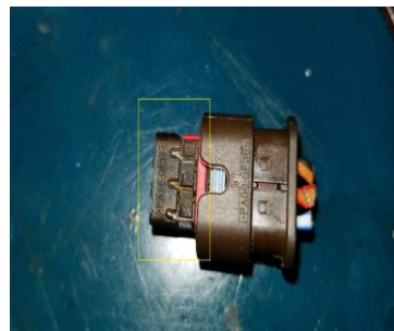
Fig 2, Example signs of corrosion

This document does not authorize warranty repairs. This communication documents a record of past experiences. STAR Online does not provide any conclusions about what is wrong with the vehicle. Rather, it captures all previous cases known that appear to be similar or related to the vehicle symptom / condition. You are the expert, and you are responsible for deciding on the appropriate course of action.