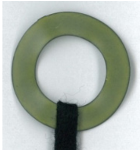
NEW Spring Wave Washer

The 3 “tang” seen on the inside of the OLD wave washer have been deleted. The new washer also has a goldish-color flurocarbon resin coating. The inside diameter of the NEW spring wave washer has been decreased and a small felt added to allow the washer to turn smoother with the buckle and have a better fit on the shoulder portion of the retaining bolt.