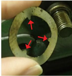
OLD Wave Washer

REMINDER: Always order the most up-to-date replacement parts based on the specific VIN being repaired.