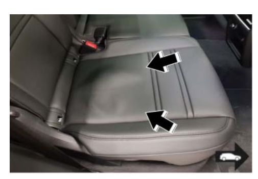
Ridge formation on rear seat