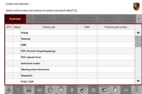
Control unit selection