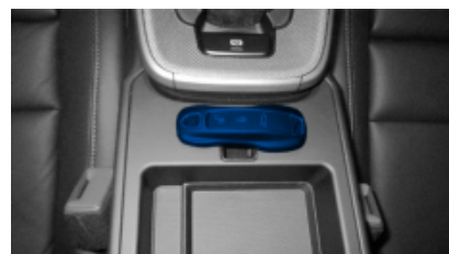
Emergency start tray